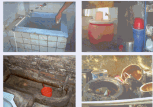
Typical water containers in Indonesia that can be potential breeding place for dengue mosquitoes