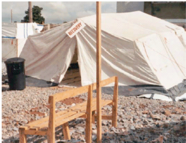
FIGURE. Treatment and recovery tents at Chawama Cholera-Treatment Center, where more than 100 patients per day were treated at the peak of the epidemic — Lusaka, Zambia, 2004

You are a field epidemiologist called in to interview community members from neighborhoods where some cases have originated. The investigation is ongoing, and no results are available yet.