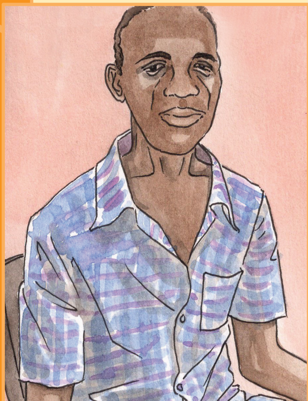
People with Chronic Illness

The Ministry of Health recommends that you get an H1N1 flu vaccine shot.